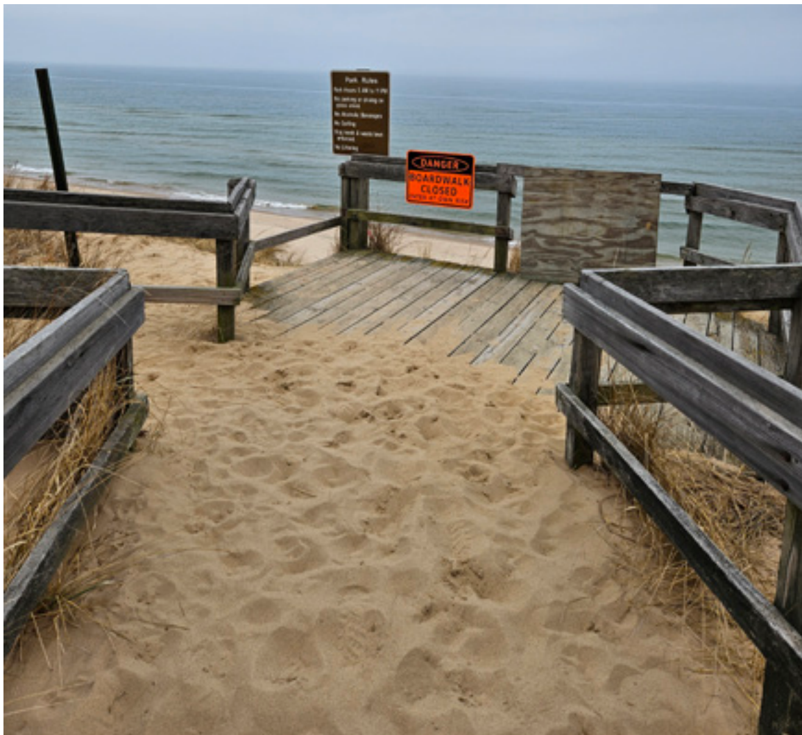
EXISTING BEACH ACCESS -Stairs have recently been replaced.