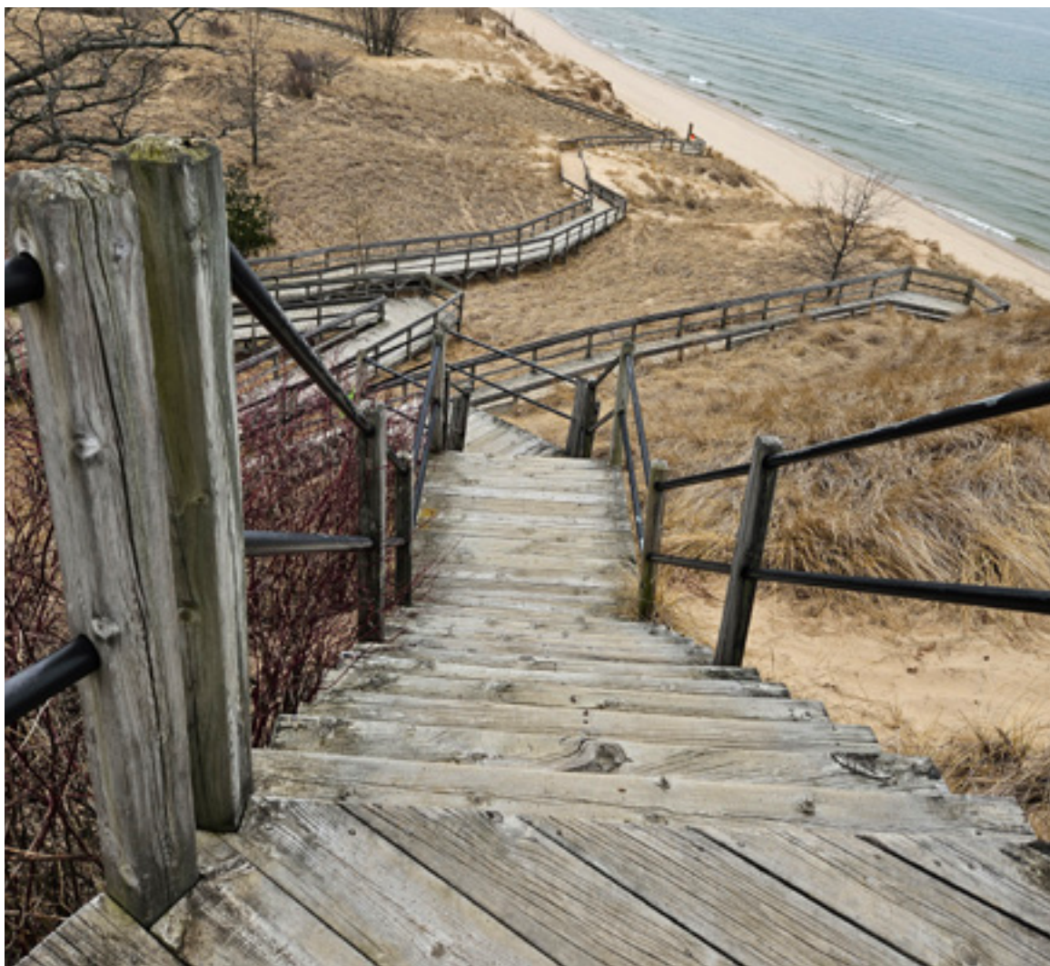
EXISTING BOARDWALK -Boardwalk is a extremely popular destination, but is aging and in need of repairs.