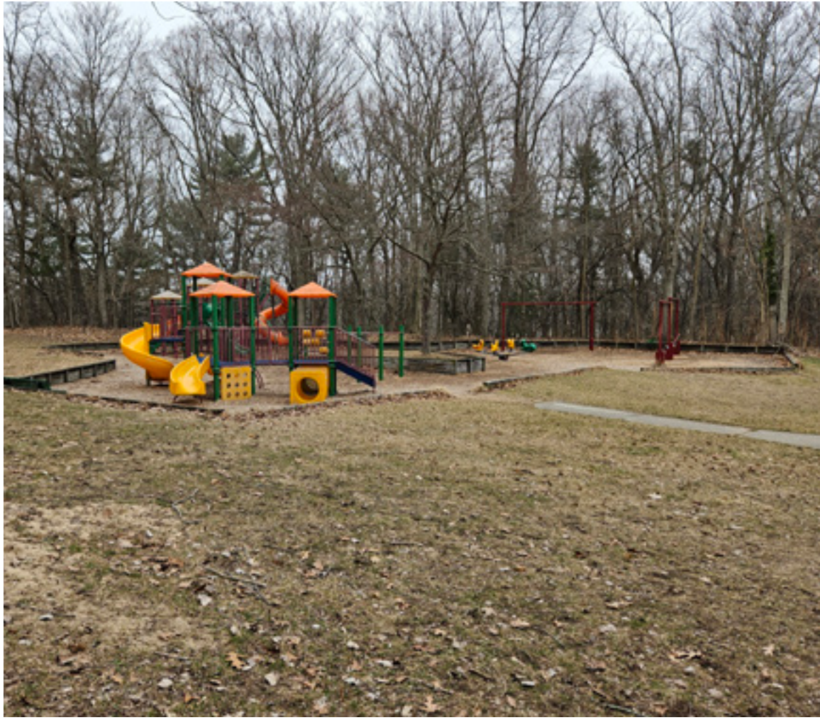
EXISTING PLAYGROUND -Equipment is old and should be replaced.