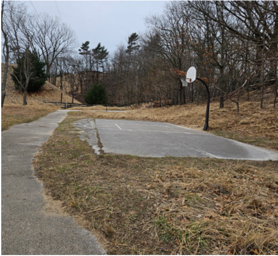
EXISTING BASKETBALL COURT -Court is small and paving in poor condition.